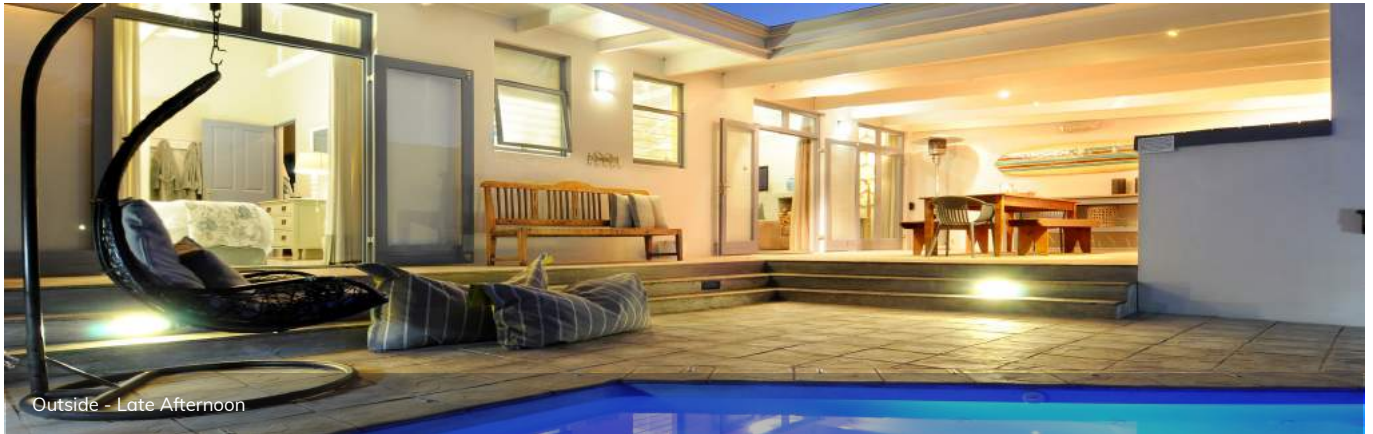
Outside - Late Afternoon